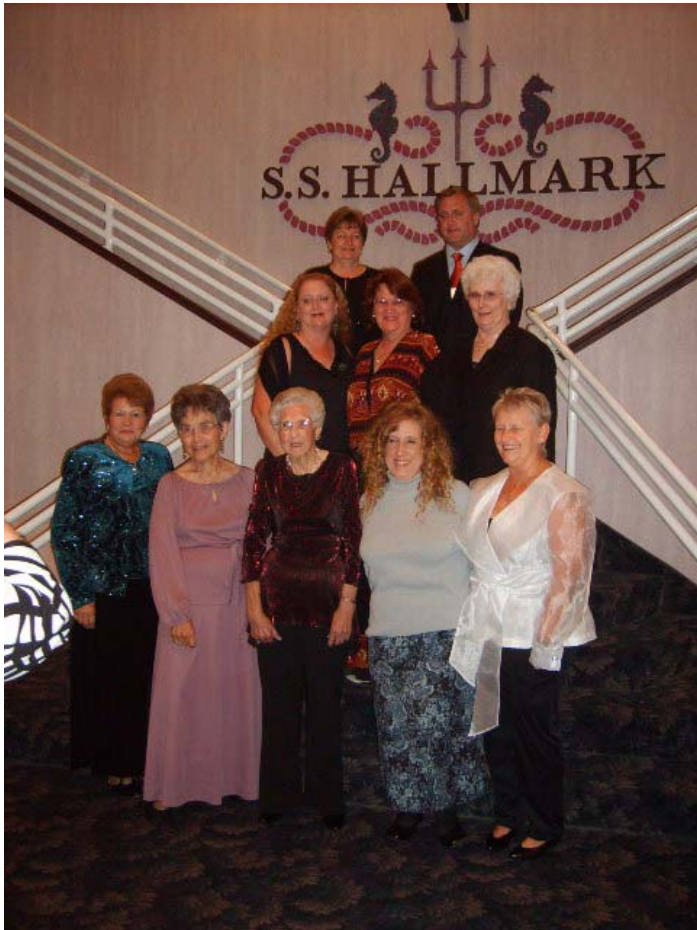
Past Credit Association of Oregon Presidents

To those of you who are unaware, this September we held the final State Conference for Oregon. The Board of Directors finally conceded that the decreasing numbers made it impossible to continue to keep the association afloat. By unanimous vote at our Fall meeting in 2006, we decided to put on one last PARTY at the coast.