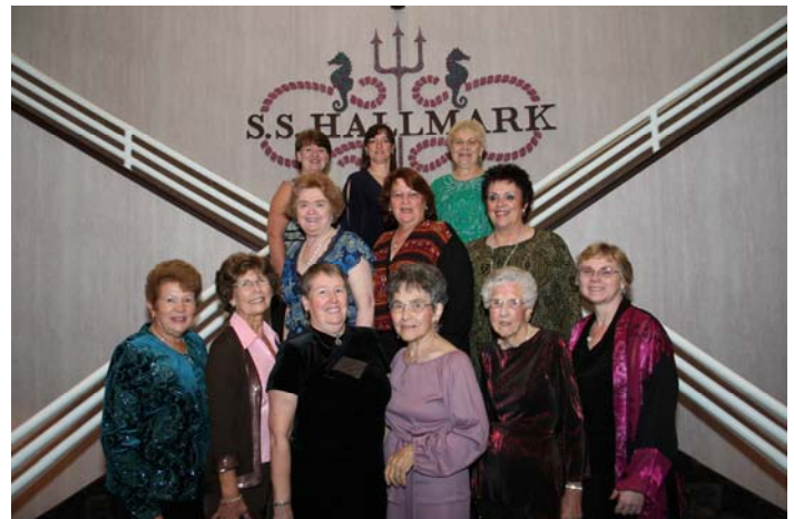
Past and present CPI District 10 Presidents in attendance at Oregon Conference