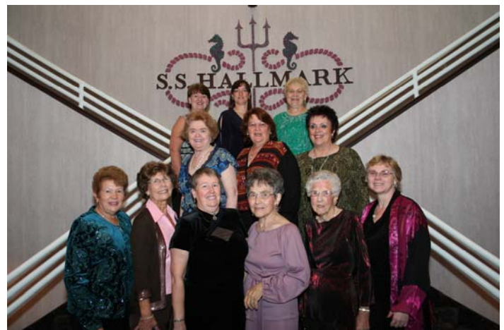
Past and present CPI District 10 Presidents in attendance at Oregon Conference